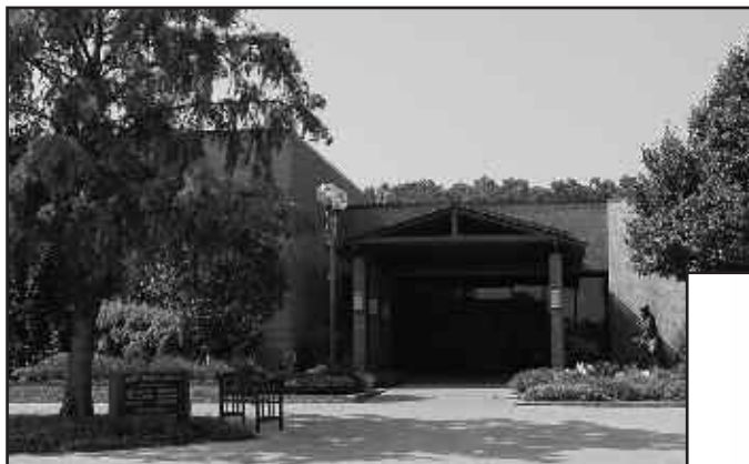
Current entrance of Hurst Public Library.